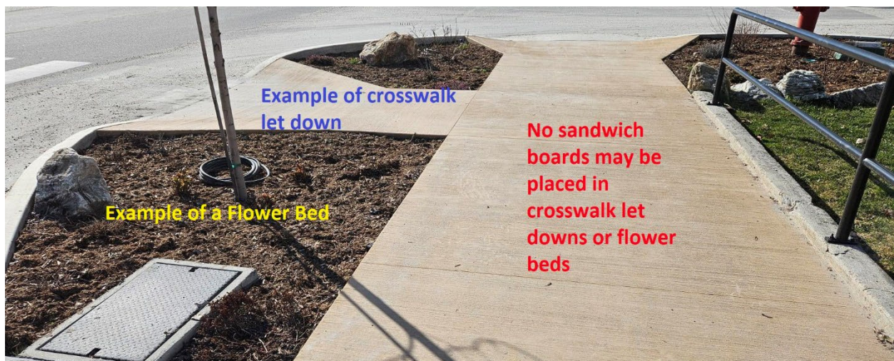
Fig. 2 – Explaining where the placement of any business items is prohibited (let downs and flower beds).